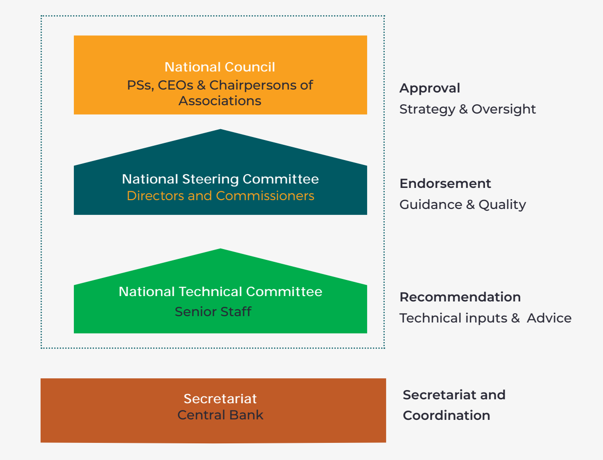
Figure 9: Coordination Structure of NFIF3