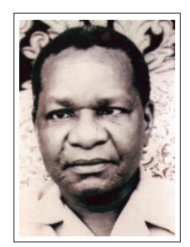
Edwin Mtei - Governor From 1966 to 1974