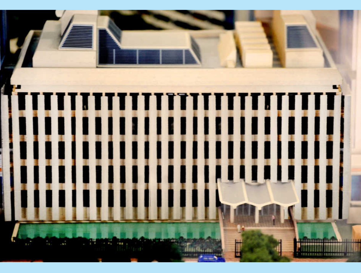
Bank of Tanzania (1966)

For any enquiries contact: Director, Economic Research and Policy Bank of Tanzania, P.O. Box 2939, Dar es Salaam Tel: +255 22 2233328, Fax: +255 22 2234060 http://www.bot-tz.org