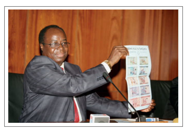
BOT Governor Prof. Benno Ndulu showing the features of the new notes.