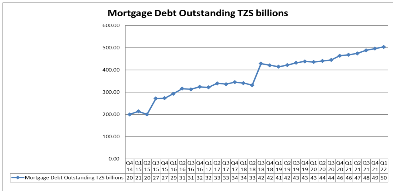
Figure 1 – Tanzania Mortgage Debt Outstanding – TZS Billions

The mortgage market in Tanzania registered a 1.41 percent annual growth in the value of mortgage loans as of 31 March 2022. Total mortgage debt outstanding that resulted from lending by the banking sector for the purposes of residential housing was TZS 503.74 billion equivalent to US$ 218.07 million. Figure 1 below shows the trend of mortgage debt from lending activities in terms of amounts over the years: