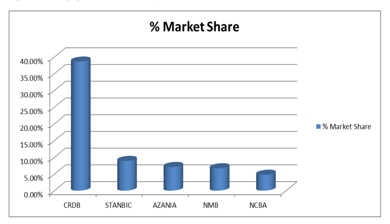
Figure 2 below shows the market share for the top five mortgage lenders as of 31 March 2022 in terms of outstanding mortgage debt.

As of 31 March 2022, 33 different banking institutions were offering mortgage loans. The mortgage market was dominated by five top lenders, who commanded 66 percent of the market. CRDB Bank Plc was a market leader commanding 38.57% of the mortgage market share, followed by Stanbic Bank (8.88%), Azania Bank (7.07%), NMB Bank Plc. (6.68%) and NCBA Bank (4.75%).